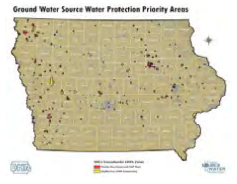
Fig. 1 "Ground Water Source Water Protection Priority Areas"; NRCS Iowa, Feb 4 2020, https://www.nrcs.usda. gov/wps/portal/nrcs/ia/technical

As an employee of the lowa Rural Water Association (IRWA), I am excited about the increased buzz surrounding source water protection the 2018 Farm Bill has generated. The increased buzz has allowed IRWA to make additional connections and partnerships related to drinking water quality. With the help of these partners, utilities, landowners, and the public we look forward to continuing to assist in source water protection efforts statewide.